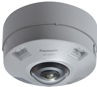
with Base Bracket