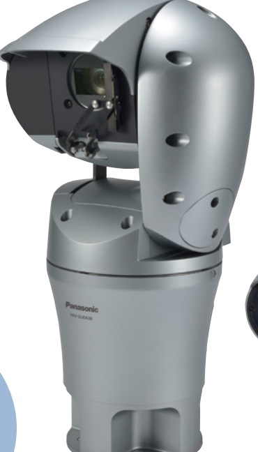
WV-SUD638 (Natural Silver) WV-SUD638-H (Gray) WV-SUD638-T (Brown)